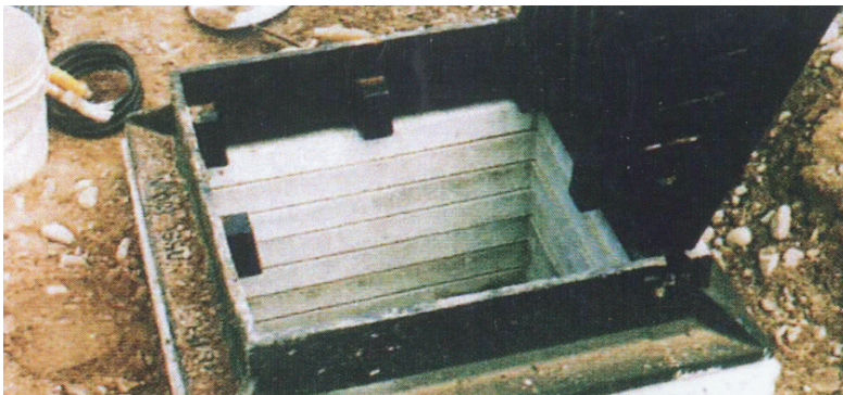
CATCH BASIN GRADE RING

All Brooklin Concrete Grade Adjustment Rings are hydraulically pressed, with a unique “Dome and Channel” interlocking feature, which allows 360° adjustment during assembly.