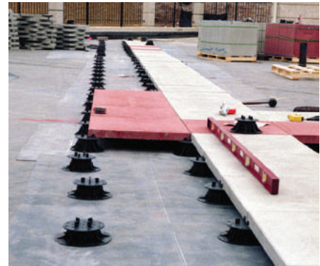
BISON ADJUSTABLE DECK SUPPORTS MODEL B2