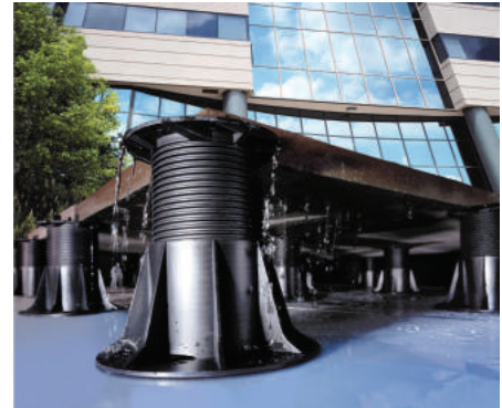
BISON ADJUSTABLE DECK SUPPORTS MODEL B4