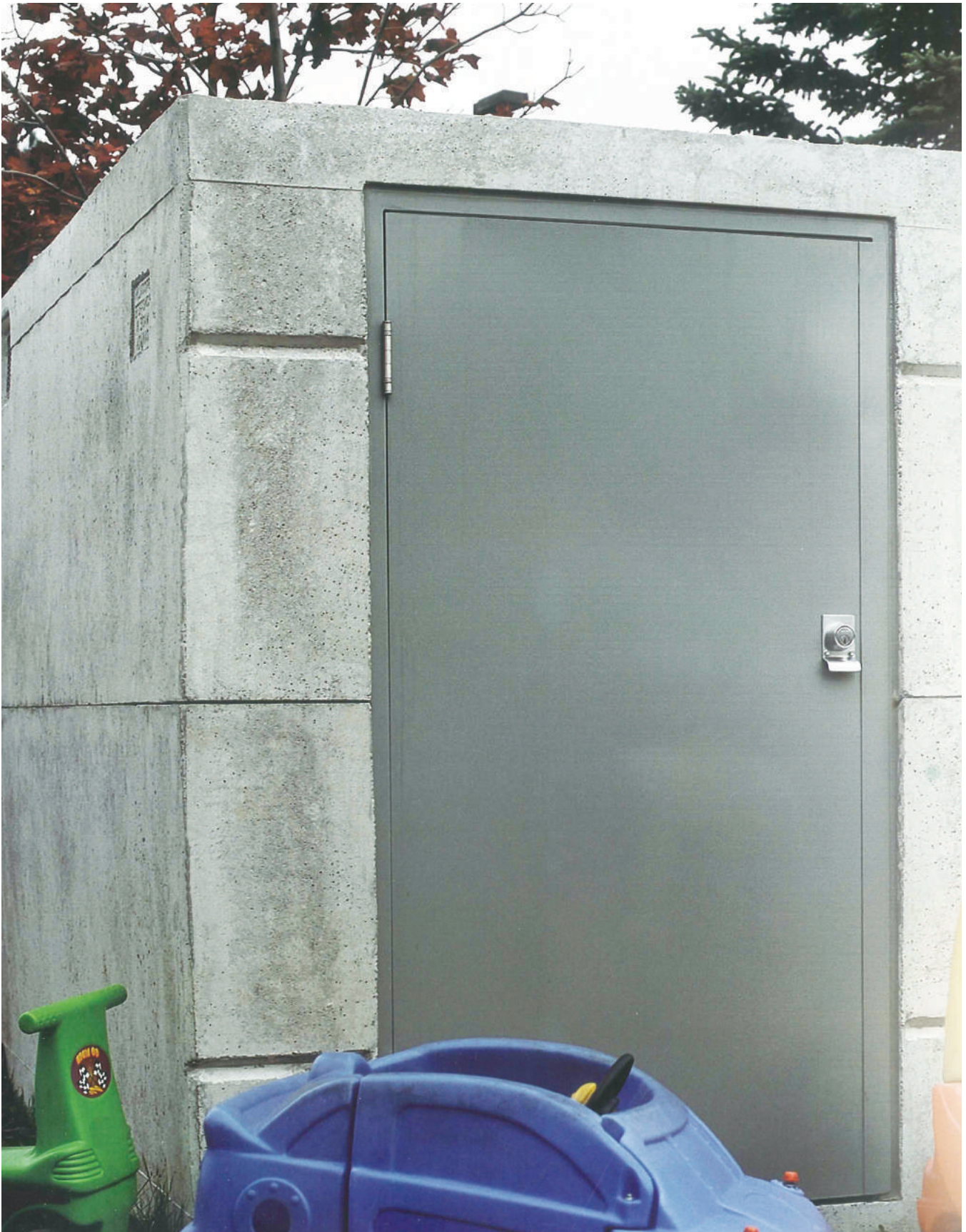
WHITBY ONTARIO - STORAGE UNIT FOR CHILDREN'S TOYS AT A PUBLIC SCHOOL