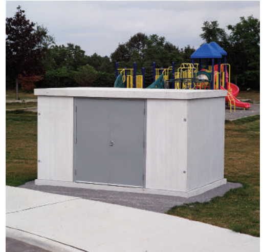
WOODBIDGE ONTARIO - STORAGE UNIT FOR SPORTS EQUIPMENT AT A PUBLIC SCHOOL

Bolted panel assembly air entrained steel reinforced concrete. Exterior corners rounded. Brushtex or exposed aggregate exterior finish. Slip resistant interior floor.