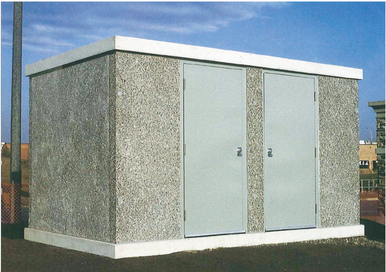
MARKHAM ONTARIO - PROTECTING PARKING LOT LIGHTING CONTROL PANELS AT A GO TRAIN STATION

Available in different sizes. The interior of these buildings can be customized to suit your specific needs. Brooklin will deliver to your desired location and we can also assist in moving the structure in the future if the need arises.