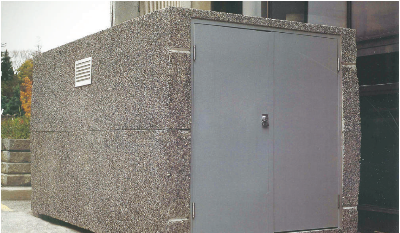
NEWMARKET ONTARIO - MAINTENANCE EQUIPMENT STORAGE FOR A HOSPITAL