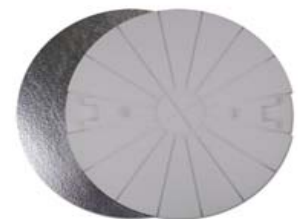
24" Insulation for Polylok Covers 3008-IN/ -INHD/ -INWT