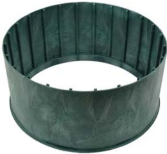
24" x 12" Riser 3008-R12