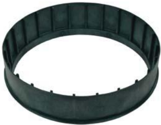
24" x 6" Riser 3008