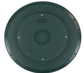
24" Activated Carbon Vented Covers 3008-ACC