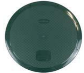
24" Flat Cover for Polylok Risers & Corrugated Pipe