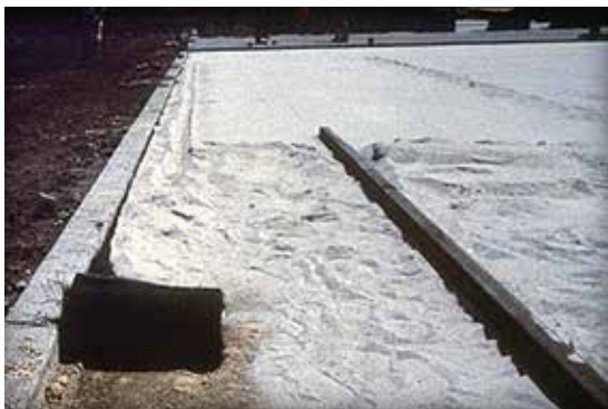
Figure 7. Woven geotextile used to contain bedding sand from migrating laterally. Visit www.icpi.org for detail drawings.

Interlocking concrete pavements should also be designed and constructed such that the bedding sand should not be able to migrate into the base, or laterally through the edge restraints. Dense-graded base aggregates with 5% to 12% fines (the amount passing the No. 200 or 0.075 mm sieve), will ensure that the bedding sand does not migrate down into the base surface. For pavements built over asphalt or con-