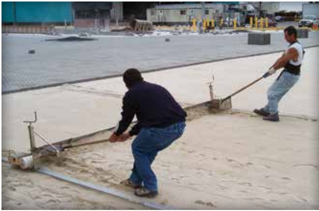
Figure 4. A two-man hand pulled screed