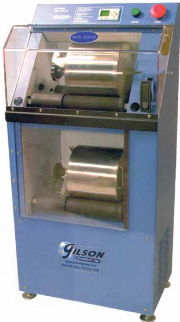
Figure 1. The Micro-Deval test apparatus.

Failure of the bedding sand layer occurs in channelized vehicular loads from two main actions; structural failure through degradation and saturation due to inadequate drainage. Since bedding sands are located high in the pavement structure, they are subjected to repeated applications of high stress from the passage of vehicles over the pavement (Beatty 1996). This repeated action, particularly from higher bus and truck axle loads, will degrade the bedding