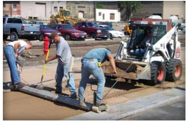
Figure 5. Mechanical screeding is the most efficient method of bedding sand installation

Role of Bedding Sand in Construction —Provided that the base was installed according to recommended construction practices and tolerances (See ICPI Tech Spec 2—Construction of Interlocking Concrete Pavements ), the bedding sand ensures that the pavers have a uniform slope and meet surface tolerances without surface undulations or “waviness.” Sand should be loosely screeded to a uniform thickness of 1 in. (25 mm) to 1½ in. (38 mm), which will compact to a thickness of ¾ in (19 mm) to 1¼ in (31 mm). for vehicular applications. Screeds can either be pulled by hand or by machine (mechanical screed) as shown in Figures 4 and 5. Mechanical screeding provides the most efficient method. Pavers are placed on the loose uncompacted sand. Contractors should select sand that allows the pavers to be uniformly seated during their initial compaction with a minimum 5000 lb (22kN) force plate compactor.