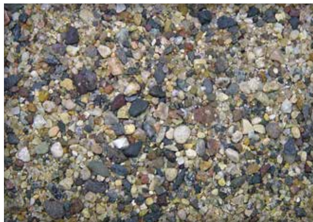
Figure 3. Example of sand from the ICPI bedding sand test program with a total combined percentage of sub-angular and sub-rounded particles equal to 65% according to ASTM D2488

Recommended Material Properties —Table 3 lists the primary and secondary material properties that should be considered when selecting bedding sands for vehicular applications. Bedding sands may exceed the gradation requirement for the maximum amount passing the No. 200 (0.075 mm) sieve as long as the sand meets degradation and permeability recommendations in Table 3. Micro-Deval degradation testing can be replaced with sodium sulfate or magnesium soundness testing as long as this test is accompanied by the other primary material property tests listed in Table 3. Other material properties listed, such as petrography and angularity testing are at the discretion of the specifier and may offer additional insight into bedding sand performance.